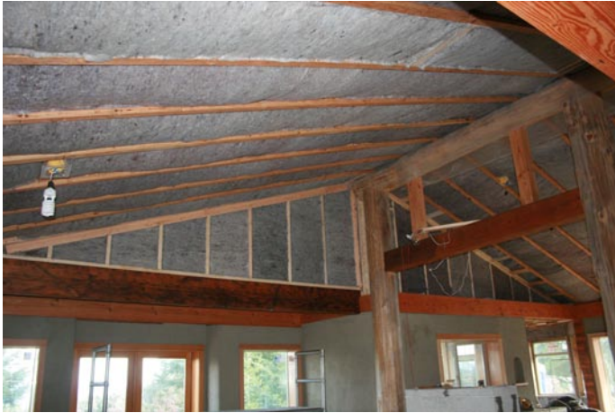
Wool insulation in the ceiling