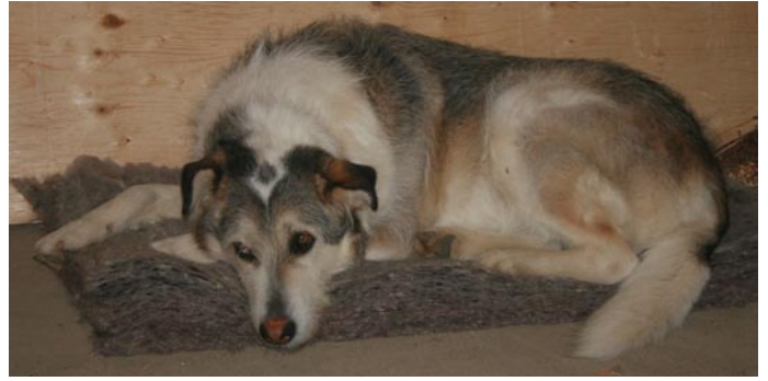
Annie found a wool insulation mat very quickly.

Last September we traveled with our friends to the Maritimes (the eastern provinces of Canada). It was a great adventure and we particularly enjoyed stopping in to visit some of our long-time customers. We had been phone acquaintances for many years and it was great to