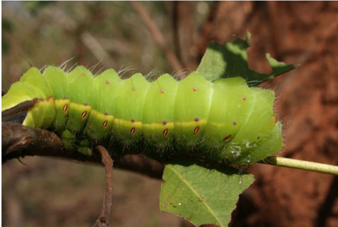
Common green tasar caterpillar