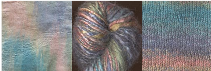
Left to right: silk fusion, hand spun and hand knit samples