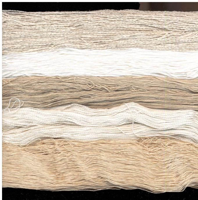
Top to bottom: noil, reeled, muga, spun and tussah silk yarns