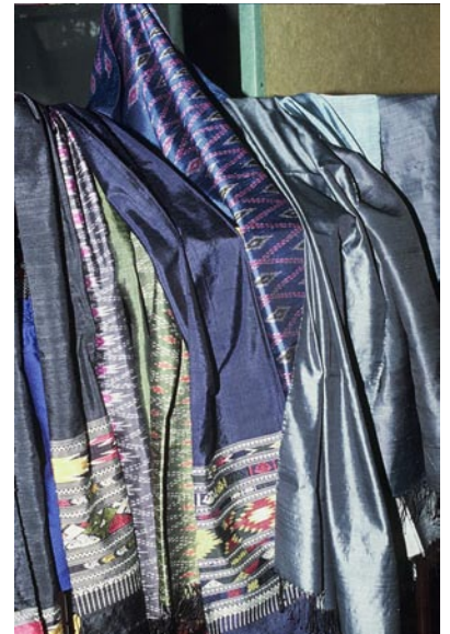
Selection of Phaeng Mai handwoven silk scarves and shawls.

Please come and join us for one of these special events and meet one of the sweetest ambassadors of the world.