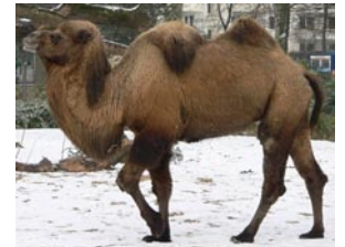
Bactrian camel, Kölner Zoo, Cologne, Germany

The camel down keeps the camel warm so the fibre is lightweight and warm with a nice lustre. Silk lends length, shape retention, sheen and durability to the camel yielding a strong yet soft fibre with a warm tan colour when blended with the silk. This yummy blend is a joy to spin, weave, knit needle felt and create other fibre arts.