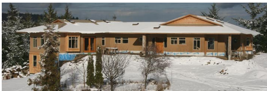
House with last coat of plaster and pigment colouring