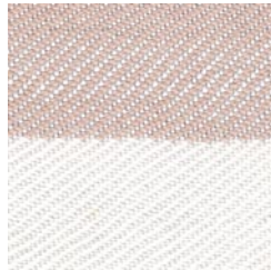
Warp: 2P Weft: 20/2 Spun Silk (top); 2P (bottom) 4 Shaft Twill, 28 EPI

Sale Price: $15.60 / 80g (approx. $12.50 US / 2.8oz)