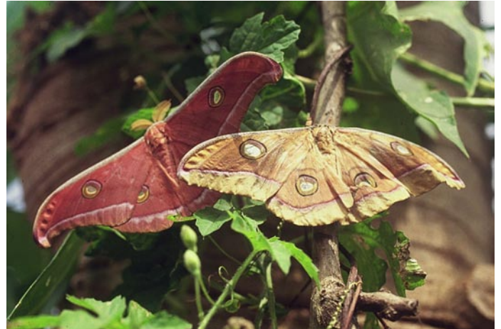
Male and female tasar moth

ready to spin their cocoon, they like to do that in their food trees as well. Rearers bring completed cocoons indoors for the moth to emerge, mate and lay eggs under a watchful eye but as soon as the eggs hatch, they must be moved outside to the trees for the babies to begin eating.