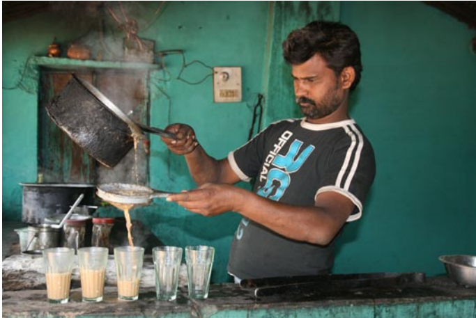
Very serious Chai walla