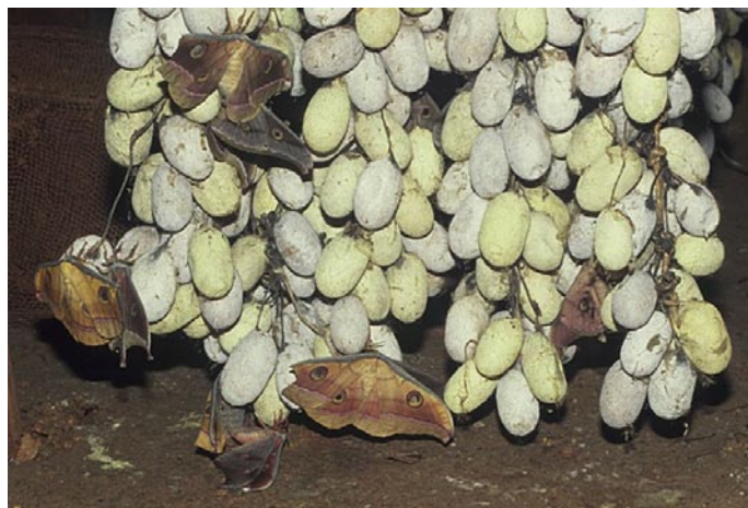
Moths emerging from cocoons in mating hut

Healthy eggs begin the process of successful silk rearing. The Central Silk Board (CSB) provides rearers with disease free layings (DFLs). The CSB is a team of scientists who are dedicated to promoting silk and improving the lives of the caretakers