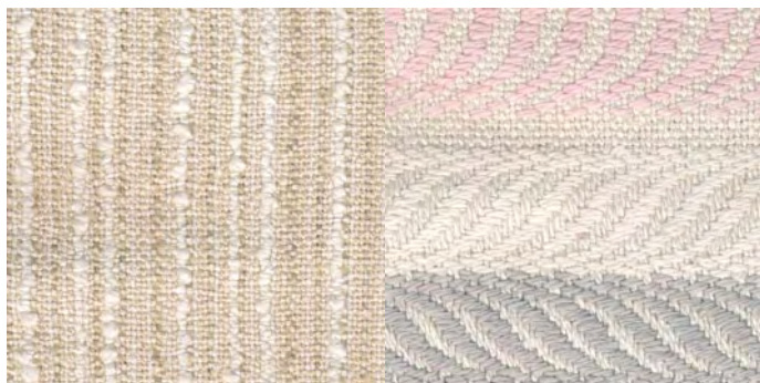
Left: 4 Shaft Plain Weave, 22 epi; Warp: 20/2 Noil Silk, Merino Wool, Silk Boucle, 120/8 Tussah Silk; Weft: 20/2 Spun Silk Right: 8 Shaft Undulating Twill at 28 epi; Warp: 20/2 Noil Silk,; Weft: 20/2 Spun Silk

Short fibres left behind after making higher quality spun silk are made into noil yarn. The shortness of fibre length results in a textured yarn with a matte look. It is much less costly than higher quality reeled and spun silks, but combines beautifully with them. The hide and seek between dull and lustrous threads lends a coy playfulness to a cloth.