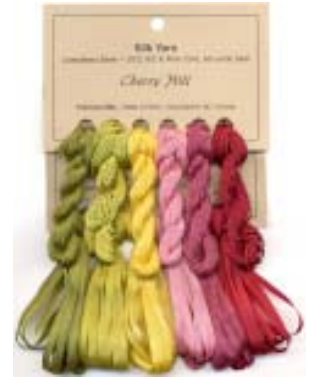
Canadiana Ribbons and Yarns