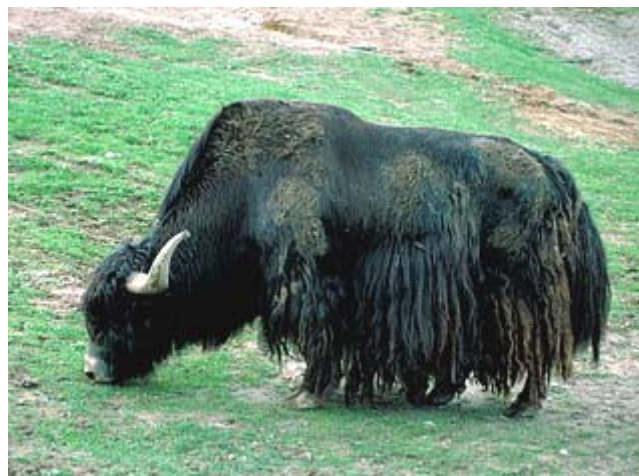
Yak from the Himalayan Mountains