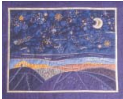
Celestial Night Sky Kit