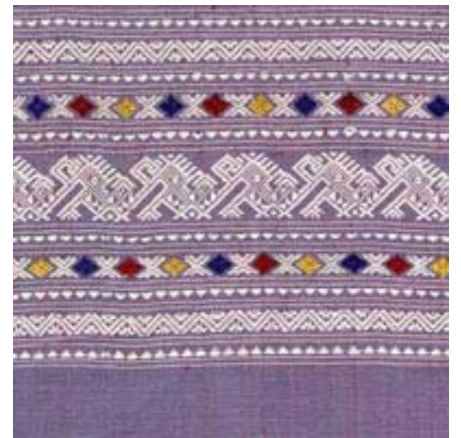
Phaeng Mai Scarf