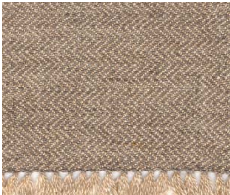
30/2 Silk/Camel & 30/2 Silk/Yak

Finish: Remove fabric from the loom. Cut scarves