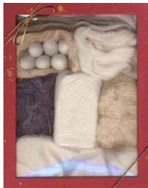
Fibre Fun Kit