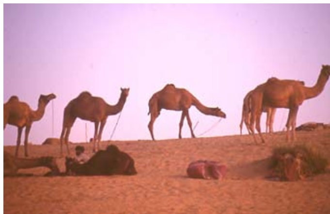
Camels in Pushkar, India