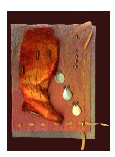
Continued on page 3...