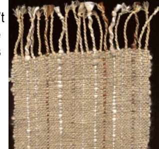
Sue Earle's handspun cashmere and silk scarf