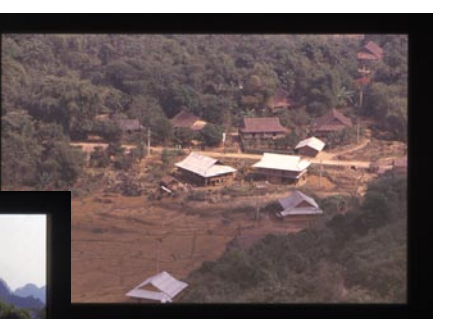
villages were made of bamboo houses on stilts. There were 20-30 houses per village with cattle and pigs living underneath some of the houses and looms pounded into the stilts of other houses. Children laughed and played in the creek and men returned from the fields on bicycles, cattle carts or motor-

We strolled to the next village chatting to folks as we went, wandering about the picturesque, idyllic weaving village. The