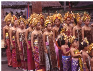
Geringsing worn at temple dance

Our last newsletter gave orientation to the historical, social and ritual/spiritual significance of the cloth of Bali. We visited villages