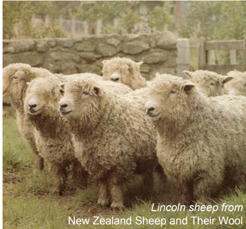
Lincoln sheep from New Zealand Sheep and Their Wool