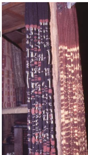
Geringsing warps tied & dyed

The designs and layout of the Geringsing cloth are influenced by the Petola double ikat cloth introduced from Gujarat, India. Double ikat designs are all made in the dyeing process and do not become apparent until the threads are woven. Both the warp and weft threads are bound with plastic to resist the dye and make patterns. The greatest skill of double ikat is in planning