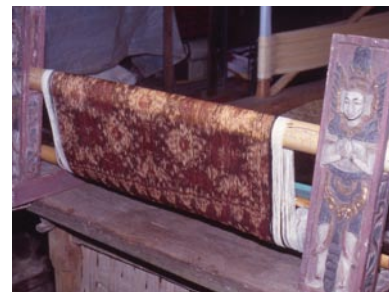
Asian Journal continued on page 8

When the dyeing is complete, the ties are removed and the threads laid out to make sure the design is correct. At this time plain threads of indigo, morinda or white are