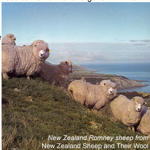
New Zealand Romney sheep from New Zealand Sheep and Their Wool

can't have finished what they had to do, as when the lambs were born there were some strange mixtures. It was obvious when we looked at the wool there were some unusual but beautiful combinations. Polwarth X Leicester, Perendale X Merino???