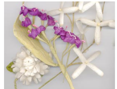
Specials continued on page 8

After degumming the cocoons can be pulled apart and fluffed into mini clouds ready to spin or use in silk fusion. They can also